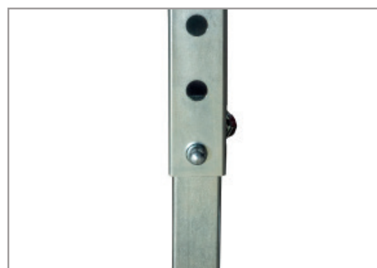
Height adjustable foot