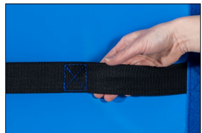
Carrying straps or handles

STRENGTH BALANCE SELF-CONFIDENCE HEALTH WELL-BEING CREATIVITY TEAMWORK