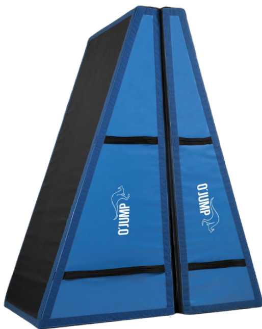
Ref. 910 WEDGES