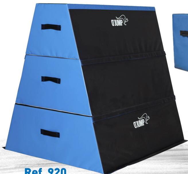
Ref. 920 TRAPEZIUM