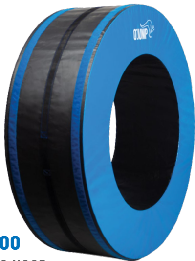
Ref. 900 TRICKING HOOP

The kit comprises the following references: