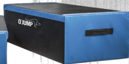
Ref. 930 BLOCKS