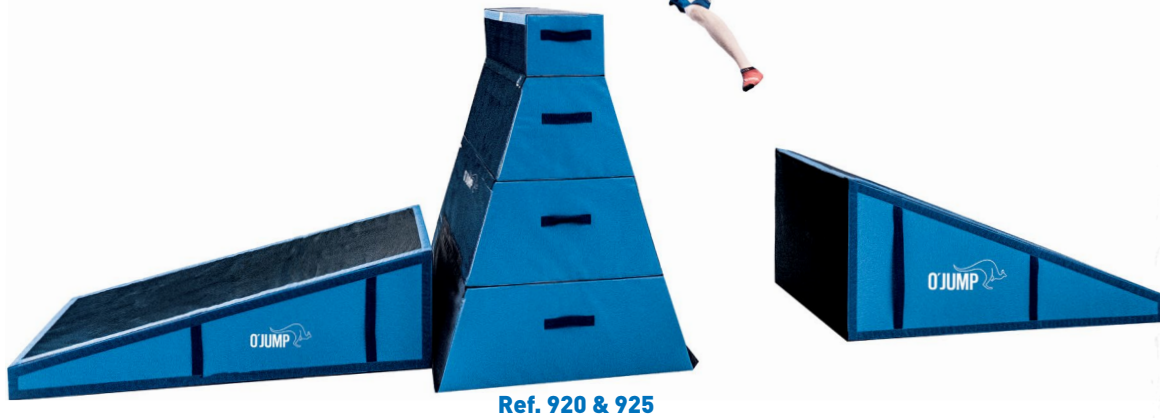
Ref. 920 & 925