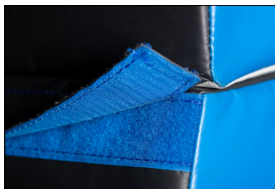
Secure joining of components by means of self-gripping strips