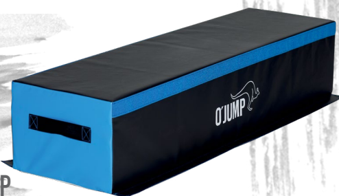
Ref. 925 TRICKING STEP